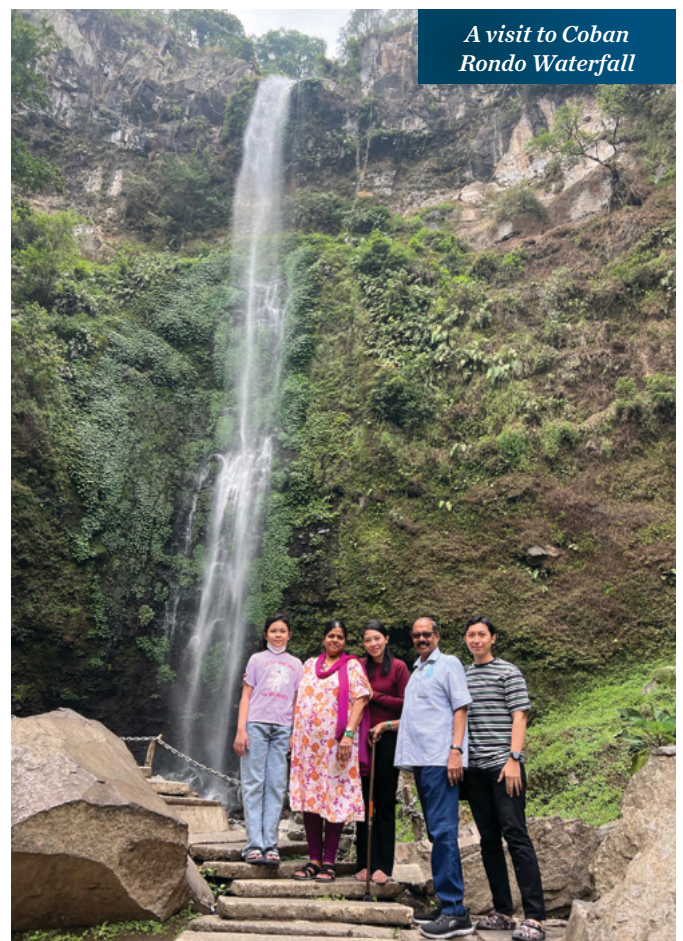
A visit to Coban Rondo Waterfall