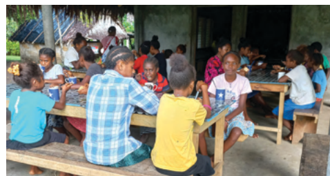
Vanuatu youth campers enjoying fellowship together

Within the camp, the campers were safe and sound and very happy hoping to meet again if God wills it at the next camp in 2025. - Jeannott Verlili